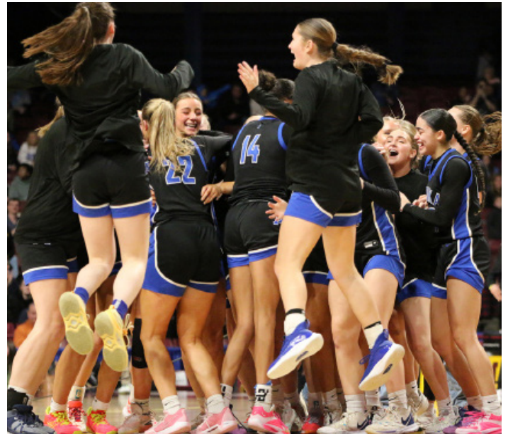
Bursting with joy after capturing state titles were, clockwise from top, Goodhue, Minnetonka, Providence Academy, and Benilde-St. Margaret's.