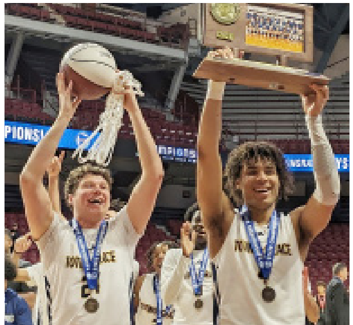
Celebrating state championships on Saturday were Breck (top), Totino-Grace (above right), Cherry (below right) and Minnetonka (below) at Williams Arena.