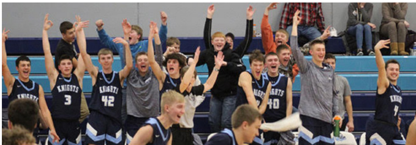
Good times: Russell-Tyler-Ruthhton starters cheered as a reserve made a basket.