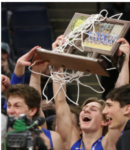
Wayzata hoists the trophy