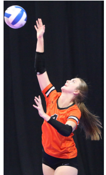
Right: Delano's Taylor Tool spikes.