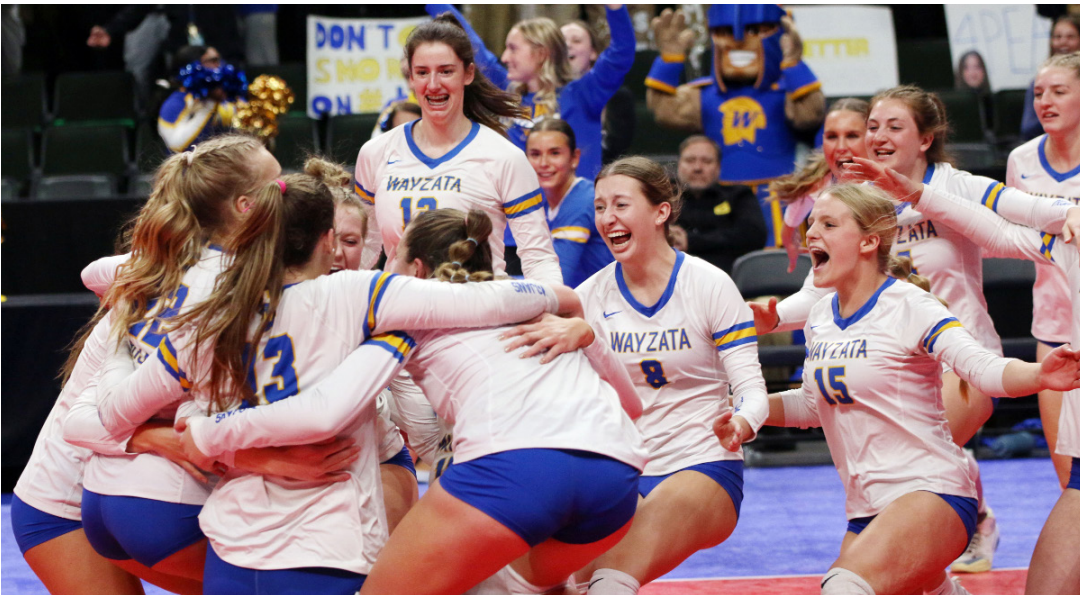
MN Volleyball News