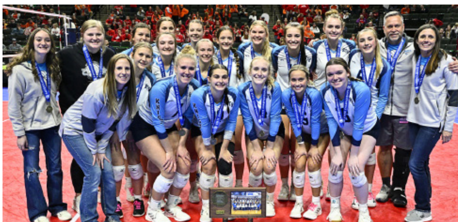
RUSSELL- TYLER- RUTH-TON